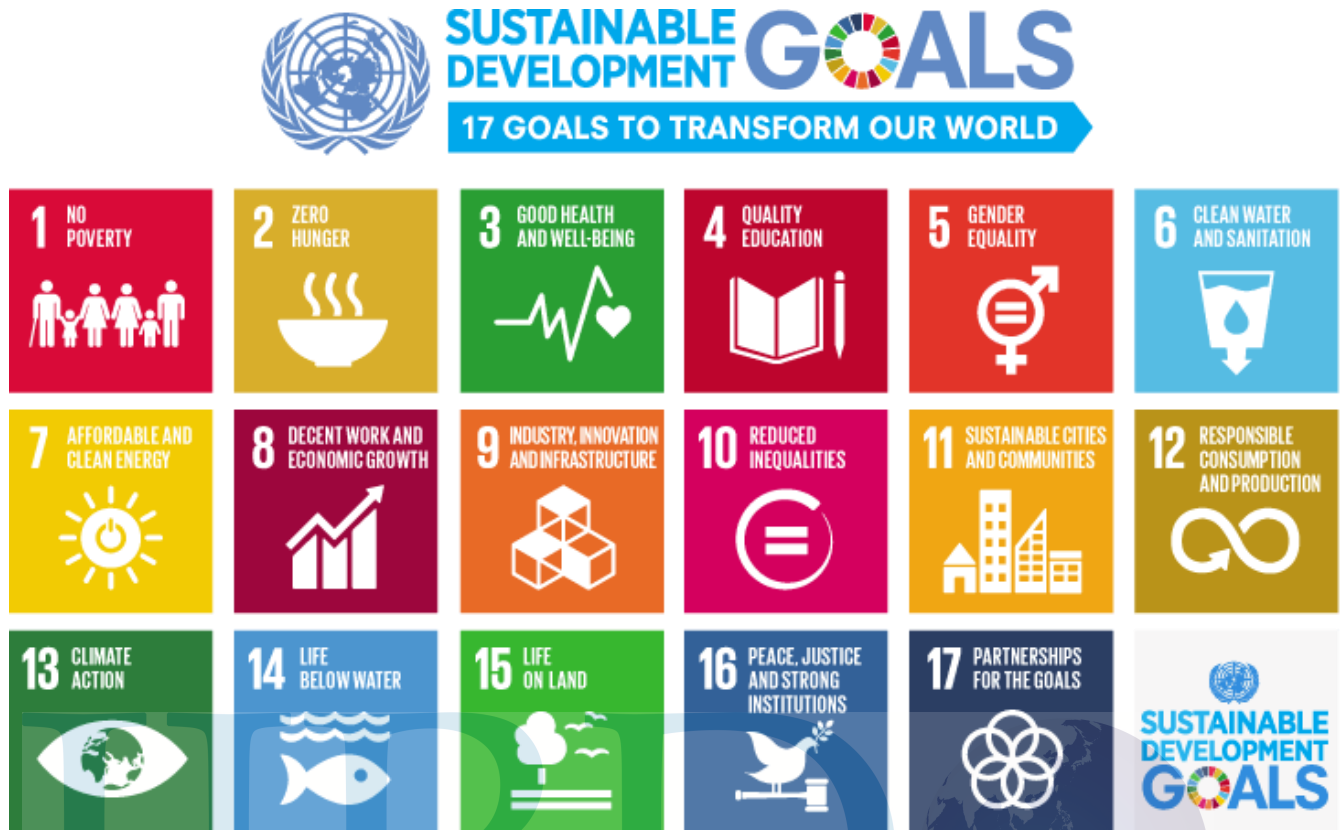
Figure 2. Infogram for Sustainable Development Goals. 2016; Bendell, 2016; Thomson, 2015)

Achieving these SDGs is about getting from words to actions: implementation. It is about applying what has been learned implementing the MDG. The core values remain equality, respect for nature and so forth. The SDG are an umbrella of overarching flexible targets tailored to regional, national and sub-national levels. Although target-driven, the SDG project must not overlook the need for transformative changes. The targets must be formulated precisely and measured continuously (United Nations [UN], 2012).