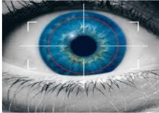
Fig1: Iris recognition