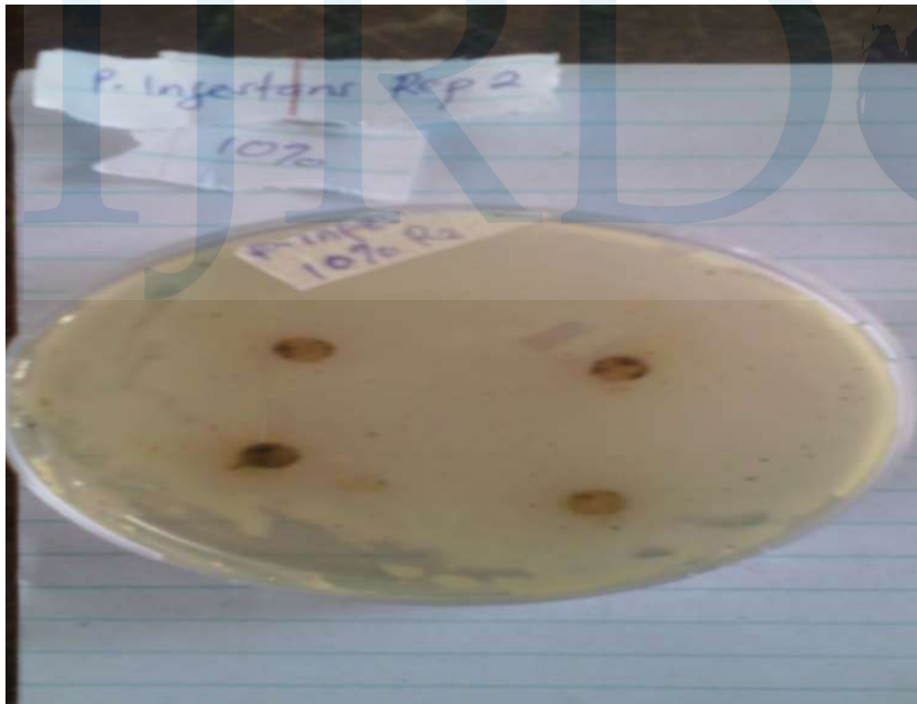
Plate 4: Zone of inhibition of leaf ethanolic extract on on P. infestans at 10 % concentration.

Plate 3: Zone of inhibition of leaf ethanolic extract on on P. infestans at A- 2.5% concentration and B- 5% concentration.