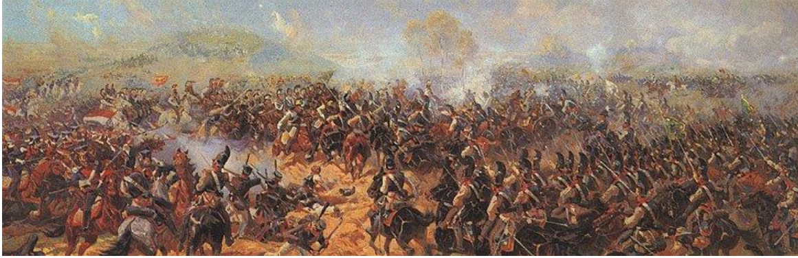
Battle of Borodino, 181